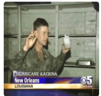
Soldier discussing his experience while being in New Orleans to help with the Katrina Effort.

To view the clip yourself go to http://cbs5.com/video/?id=6789@kpix.dayport.com .