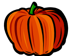
Halloween has its origins in a Celtic tradition of Samhain.

Dead on Halloween. The spirits supposedly rose from the dead and, in order to attract them, food was left on the doors. To scare off the evil spirits, the Celts wore masks. from Wikipedia.com