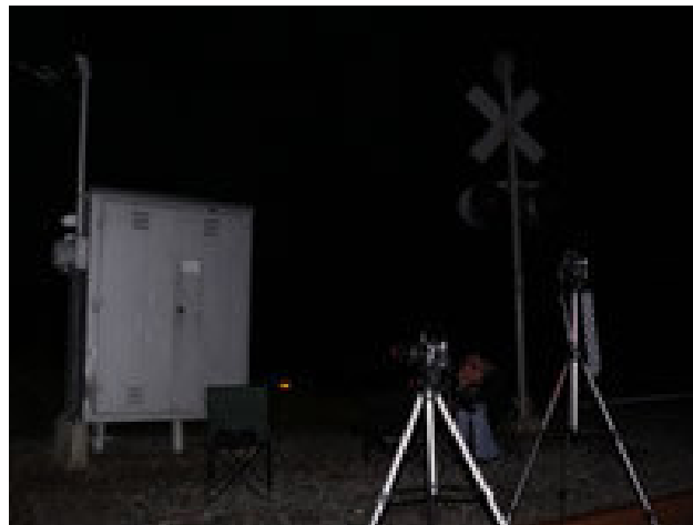
Setup for a typical night time investigation

vestigators only work during certain hours. In occult study the designated hours for hauntings to occur are called the psychic hours and they exist from Midnight (the witching hour) to 3:00 AM (with of course 3 am being the devil's hour).