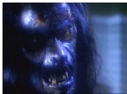
What's howling in Ohio?