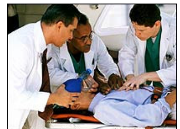
Many O.B.E.s occur when people narrowly escape death.

"In this study we aim to take the theory a stage further, by looking at the way people see and experience their bodies, and how - through perfectly ordinary psychological processes - these images and experiences may create the impression of seeing their bodies from the outside."