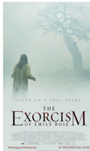
The Exorcism of Emily Rose opens in theatres on September 9th

For more info including the film's trailer please visit http://www.sonypictures.com/movies/theexorcismofemilyrose