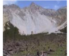
Revelations and mountains seem to go hand in hand—now science takes a hard look as to why

nological, functional, and neural findings we suggest that exposure to altitudes might contribute to the induction of revelation experiences and might further our understanding of the mountain metaphor in religion.