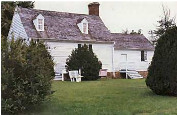
The Hillsman House

We use strict SCIENTIFIC methods to obtain TANGIBLE evidence - Evidence that leaves no doubt about its origin, cause and effect. Evidence that will be reproducible under controlled testing conditions. (example - If a ghost is residing in a home and is able to be clearly picked up by videotape, then it should be able to be clearly picked up upon testing replication.)