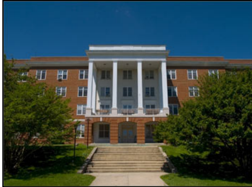
Stubbs Hall @ Longwood University