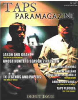
Cover of the June issue of TAPS Paramagazine.