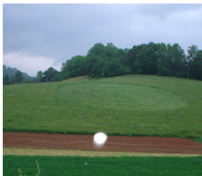
Picture of crop circle in the same area as the Weaverville circle.