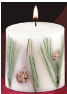
Who lit the candle?

Wanna see it? Look for the show to air on TLC during the fall.