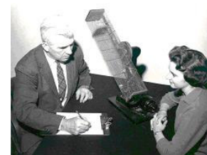
J.B. Rhine working on experiments with PSI.

There will be a Friday evening talk, an all-day Saturday session with an evening party, and a half-day Sunday session.. Cost for entire weekend $150, Friday evening alone $20. For more specific information call the RRC or check the website..