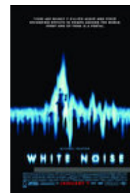
White Noise DVD cover.