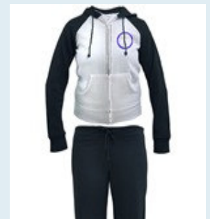
Buy CPRI stuff to support our research.