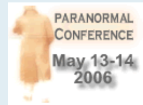
CPRI 1st Annual Paranormal Conference to be held in Richmond.

will be there with merchandise and you can