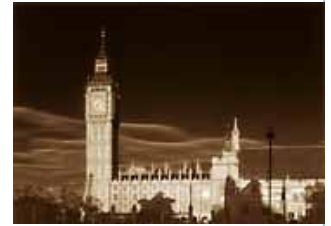
Big Ben is one of London's most famous landmarks.