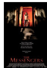
The movie poster for The Messengers

and John Corbett, the Solomon family has left big city life for a secluded farm in North Dakota. Soon after they arrive at their new home, 16 year-old Jess and her 3 year old brother begin seeing ominous apparitions that no one else can see, and are repeatedly attacked by something from the other side. Now they