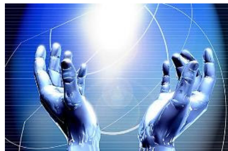
Can the mind rule over matter?

Please send your experiences to srfeather@nc.rr.com