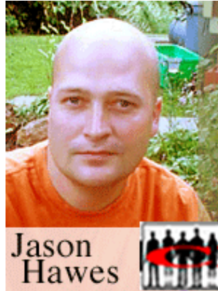
Jason Hawes of T.A.P.S.—a CPRI Honorary member

Over the years, TAPS has accumulated clients with surprising speed — victims of troubled or restless spirits who needed their help. Jason,