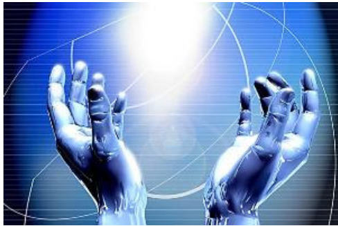
Is After Death Communication Possible?

An After-Death Communication (ADC) is a spiritual experience, which occurs when you are contacted directly and spontaneously by a deceased family member or friend, without the use of psychics, mediums, rituals, or devices of any kind. It's estimated that 50-100 million Americans - 20-40% of the population of the United States - have had one or more ADC experiences.