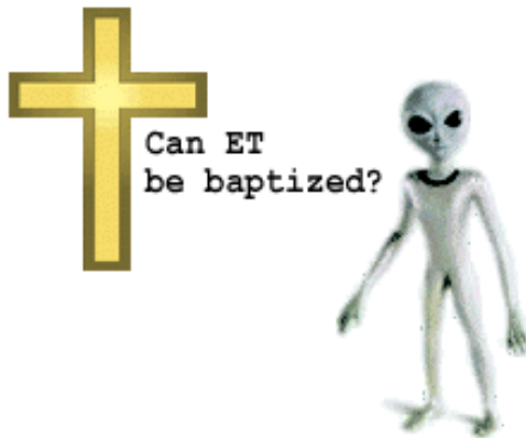
The leading astronomer for the Vatican has to decide if ET phones Rome could it be baptized?

Wanna read more? www.sundayhearl.com/530 20