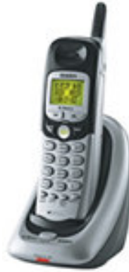
Did this woman receive a call from beyond the grave?

funeral, my mothers phone rang 1/2 of a ring, and later went dead for several hours, probably about 8 hours that day. It came on eventually, and Bellsouth could find no line problems. Well, the next day, my son's phone did the same thing, 1/2 ring, and the line was dead for about 8 hours. Once again, Bellsouth said no line problems. When my mother found out my son's phone was out, she asked