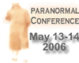
CPRI prepares for its first paranormal conference in May of 2006.