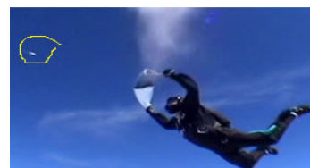
Can you identify the strange sphere in the sky?

be no aircraft in the area because it's against FAA regulations to fly in an area during jump operations. Also, if you could see the event in real time, it's traveling at a tremendous speed. There was no noticeable atmospheric disturbance (sonic boom) during the skydive.