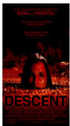
Movie poster for The Descent

After a tragic accident, six friends reunite for a caving expedition. Their adventure soon goes horribly wrong when a collapse traps them deep