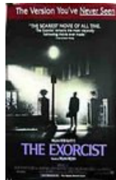
The Exorcist Movie made exorcism a household word.