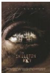
The movie "The Skeleton Key" is in theatres now.

The Center for Paranormal Research and Investigation is a non-profit organization based outside of Richmond, VA. We conduct investigations into the paranormal in a non-metaphysical manner. One of our main goals is to seek out allegedly "haunted locations"* and to assist those who are experiencing problems with the paranormal. We then look for authentic evidence of the paranormal and try to determine if the location is haunted*. We are seeking genuine evidence and are careful about the presentation of this evidence... insuring that it is legitimate, researched and analyzed before being presented to the general public.