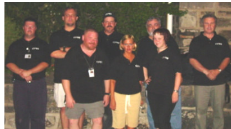
CPRI members pose outside of ESP

actually be going back to ESP sometime in September to get additional footage at the prison. No one from CPRI is complaining though because re-