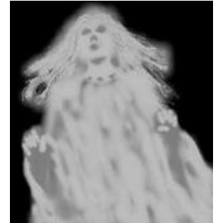
Who's the ghost girl at Harbour Point?